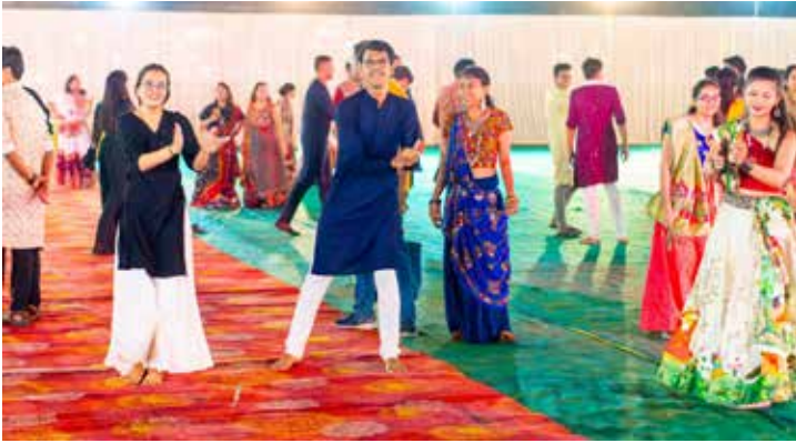
Capturing the vibrant colors of Rangratri as we celebrate togetherness and traditions at the Vasai Branch of WIRC, ICAI on October 29, 2023