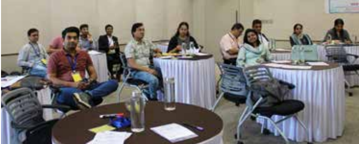
Gathering for Growth Participants at the Two-Day Knowledge Workshop on October 8, 2023, coming together to expand their horizons and acquire new insights.