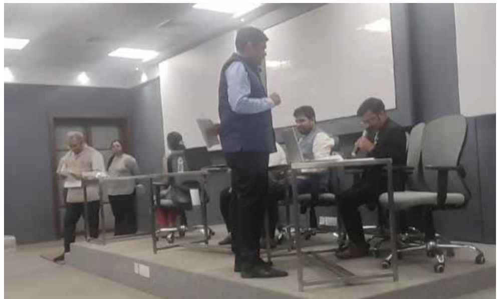
Navigating the Tax Landscape: A snapshot from the insightful Seminar on GST held on October 21, 2023. Unveiling the intricacies of GST for a brighter economic future.