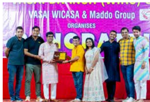
Greeting our valued sponsors and enthusiastic participants with open arms at the Rangratri Celebration and Garba event at Vasai Branch, WIRC of ICAI. Your support and presence make this celebration truly special.