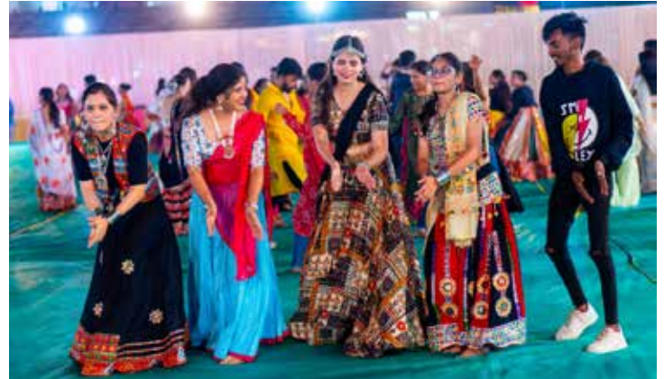
Embracing the cultural tapestry at the Rangratri Celebration and Garba night, where tradition meets joy.