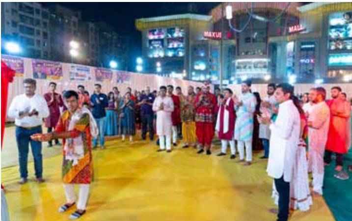
Radiating devotion as we offer Ma Amba Aarti during the Rangratri Celebration and Garba night