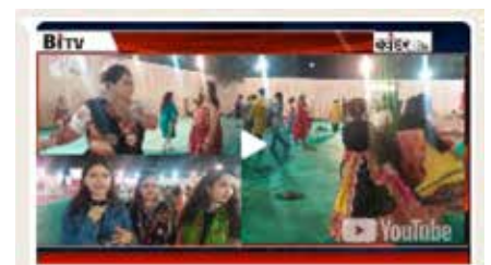
News feed https://youtu.be/DiUSuvEK5uo?si=qYm2ppaBmo3X-Jr0